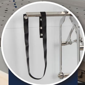
Suspention point headband