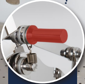
Handle to unlock fingers