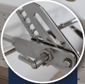
Adjust the shoulder width